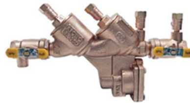
duced Pressure Backflow Prevention Assembly (RP)